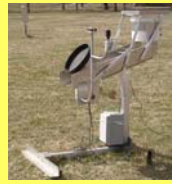
YES TPC 3000